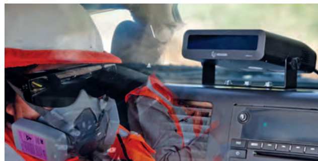
Enhancements to the OAS 6.1 algorithm, combined with the continual growth of the machine-learning capabilities, mean operators can wear face masks while still being monitored for signs of fatigue and distraction, Hexagon says

He highlighted that the parameters of Level 9 control have evolved over the past year or two.