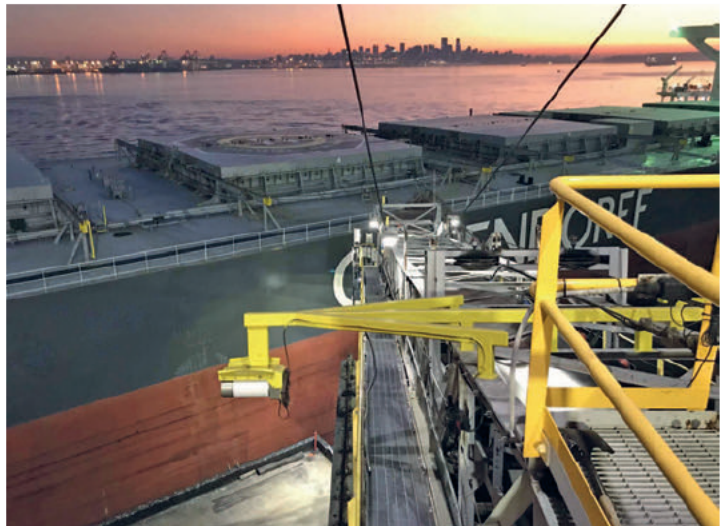
Shiploader boom with indurad iSDR-H 2D sensors on the left- and right-hand sides of the boom