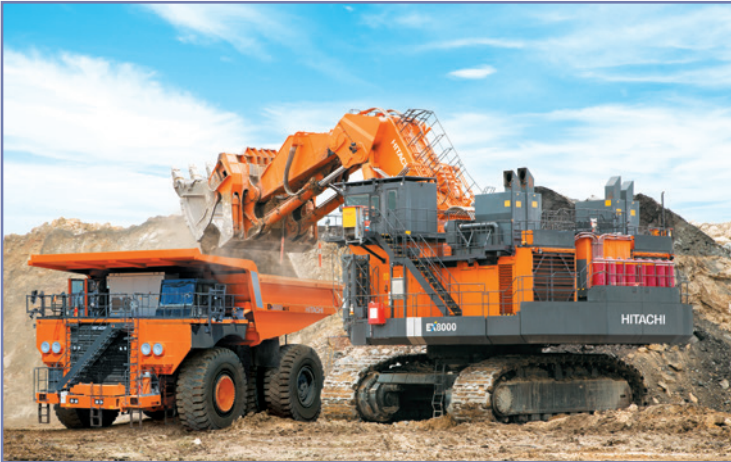
The Hitachi EX8000-6 excavator loading a Hitachi EH5000AC-3 truck

Schools tells MM: “For example, a main ore-conveyor drive bearing that is beginning to fail can be detected with Emerson’s PeakVue technology months before failure.