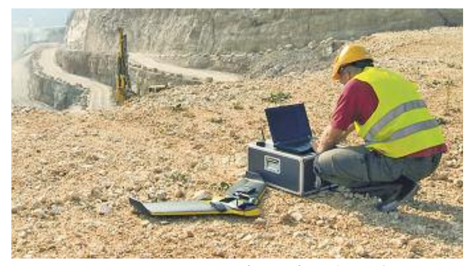
Two senseFly drones were used at Energizer's Molo graphite deposit in Madagascar

and was happy to share its data. With access to this info, Energizer and DRA were able to narrow down the target region to a much more manageable 150 km<sup>2</sup>. We chose to employ drones for two reasons. One was the price. This was very low compared to a LiDAR survey, which would have cost hundreds of thousands of dollars, even with our reduced survey area. The second was that by making a capital investment in two eBee drones, we could then fly these over our other properties in Canada. Since we now have the technology we need to produce digital elevation models and air photos ourselves, we don't have to hire third-party companies to do this for us."