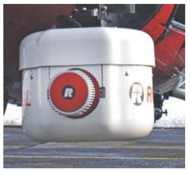
The new RIEGL VP-1 with an integrated RIEGL VUX-SYS

The component weighs around 19 kg and is a robust and reliable airborne scanner carrying platform with a full mechanical and electrical integration of sensor system components into aircraft the fuselage. IM