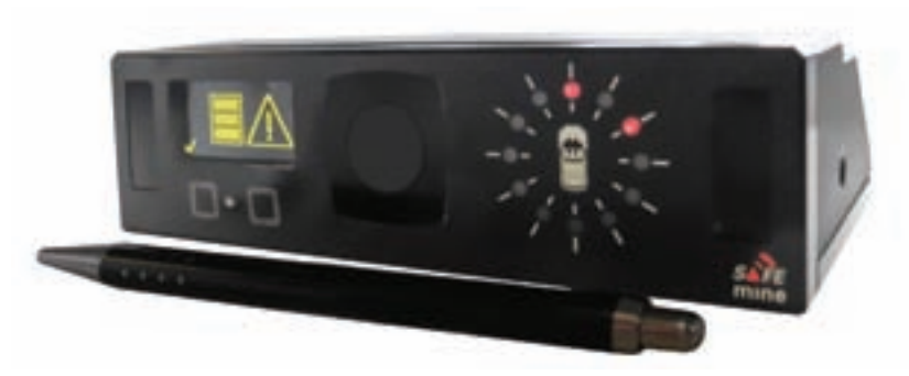
FatigueMonitor is an innovative solution that integrates data from fatigue detection and collision avoidance to minimise accidents involving mining vehicles

Now the Switzerland-based company has launched FatigueMonitor, which is integrated with CAS.