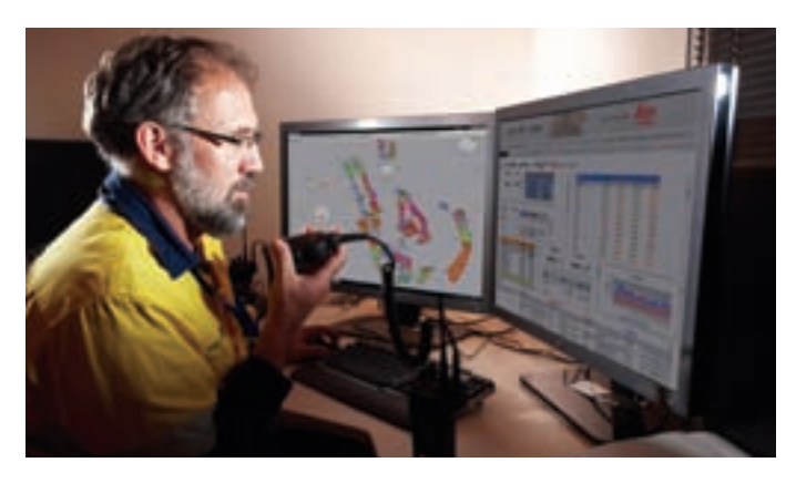
Leica Jigsaw makes sense of the data deluge. helpina mine staff to solve problems in near-realtime

a life-of-mine estimated at 10 years, and the potential to process 8,000 tonnes of ore per day.