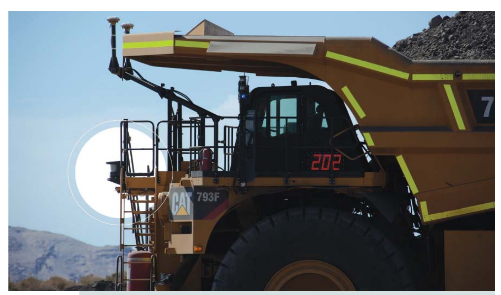
Cat MineStar Command for hauling uses LiDAR technology that evolved from a solution on the civilian market. It is the 'best perception system out there,' Caterpillar reports.

ligence, backed by a proven change management methodology to ensure a meaningful safety culture prevails," Hirtz said.