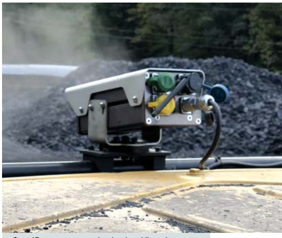
OmniPro uses award-winning Visual Artificial Intelligence to detect and alert for people, vehicles and stop signs.

Safety managers can use it "to determine areas most likely to have close calls and to identify training opportunities," he said. "It can benefit 'near-