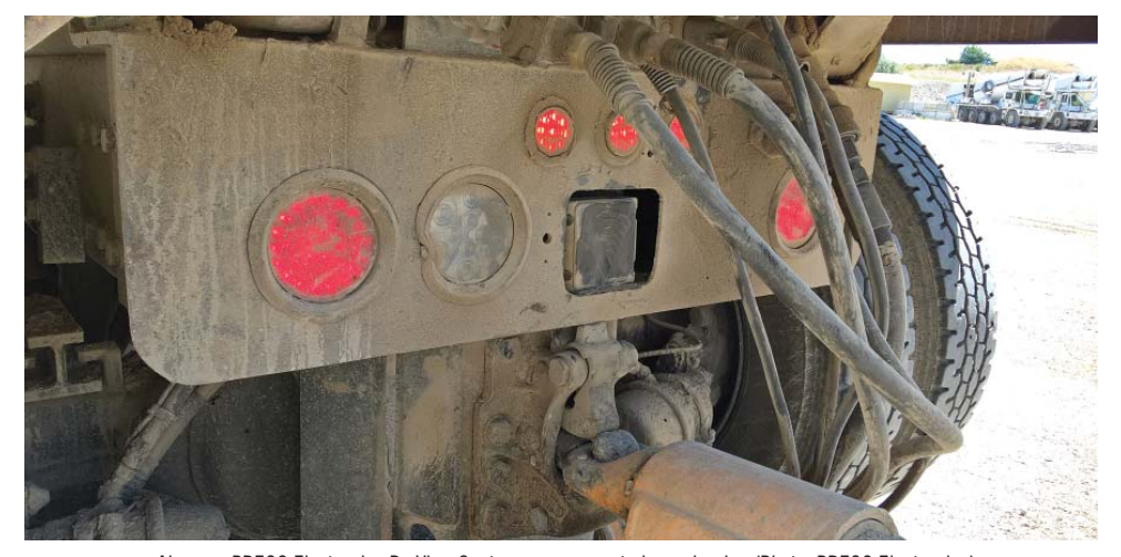
Above, a PRECO Electronics PreView Sentry sensor mounted on a hauler.

Similar solutions in this space are often pitched as both machine awareness