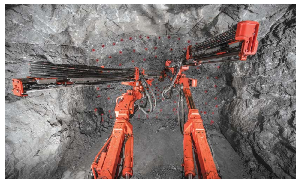
Above, an automation package will be offered later this year as an upgrade on two Sandvik development drills that will offer a boom collision avoidance capability.

"As well as enhancing productivity, it reduces the risk of personnel exposure to weak ground conditions, such as at the face itself, and also the need to get in and out of the operator cab, which is one of the main causes for various ankle and knee injuries within the underground mining industry," Välivaara said.