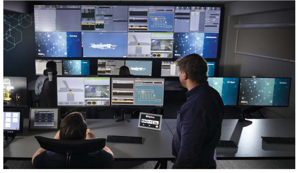
Fleet coordination in TMS is handled by a central node that uses data from an array of sources, a mine planning system, and a mine traffic control system. At the Epiroc Control Tower in Sweden, customers can explore and develop effective automation and information management solutions.

we have some logic, and get some optimization that prevents those machines from colliding if they are sharing a task or are sharing a part of the mine."