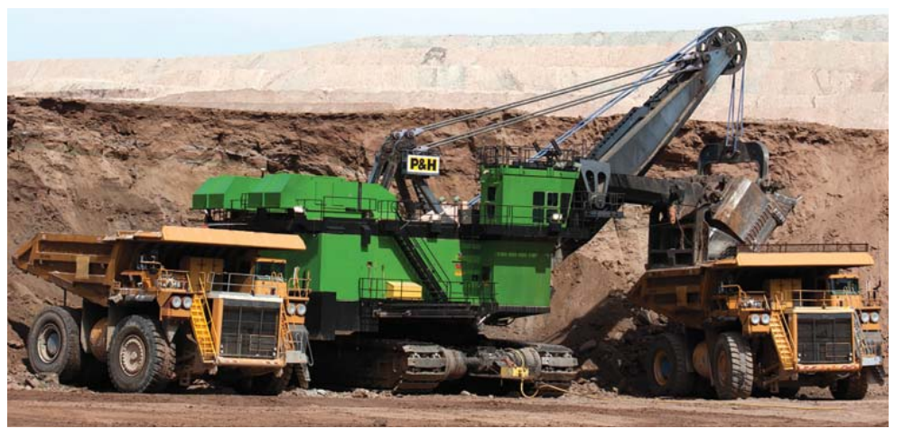
Modular's ProVision Guided Spotting System in some cases can contribute up to eight additional loads per hour, the company reported.

day, from a safety standpoint, we eliminate a spot automatically if the shovel was to breach either one of those loading zones as it moves, in which case it prompts the operator to reset that spot on either side."