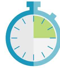
Time Allocation Tracking

Any personnel on the mine can have the production in the cell apps. It removes the process to go the control room for knowing the production, or miss communication by radio what is the production.